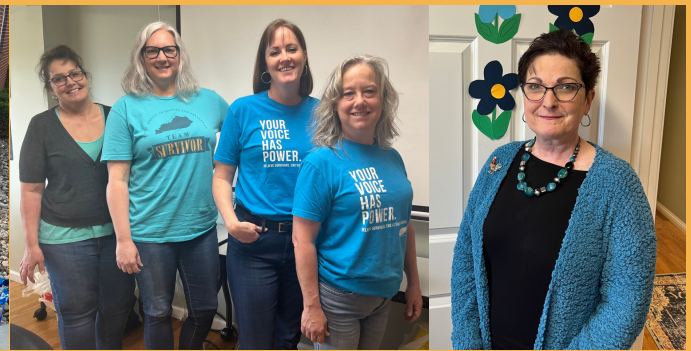
Wear Teal for Sexual Assault Awareness