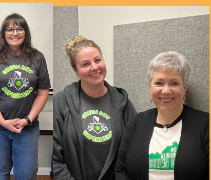
Wear Green for Green Dot Bystander Intervention