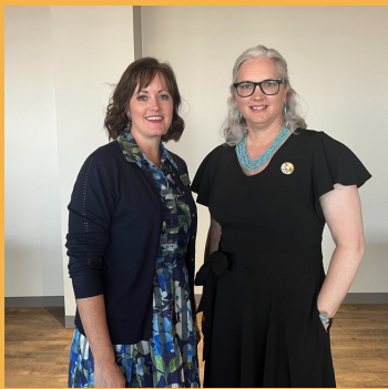
SAAPM Kick Off

April was Child Abuse and Sexual Assault Awareness Month. As always, we were humbled by the outpouring of support from the communities we serve. We had many events on the calendar, with our Art Gallery Fundraiser finishing the month off. We want to send a huge thank you to everyone who participated in one or more of our events. YOU'RE THE BEST!