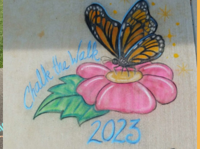
Chalk the Walk