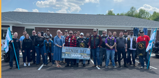
SHARP Motorcycle Ride